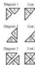
Block Construction Diagram