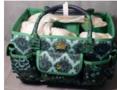
Bear Creek Quilt Guild, Inc.