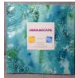
Best of Bernina