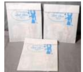
Not Your Mama's Quilt Store