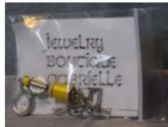
Jewelry Boutique Gabrielle