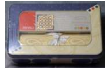
Material Girl Quilt Shop