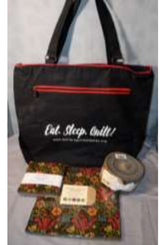
Quilter's Guild of Dallas