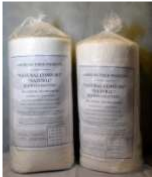
American Fiber Products