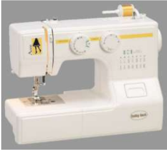
Plano Sewing Center

Our goal is to have 100 door prizes to give away at RD 2017! The first door prize to be given away is: