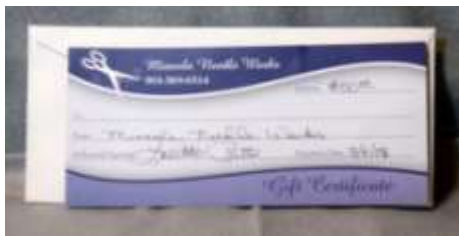
Mineola Needle Works