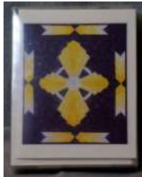
J. Michelle Watts Designs LLC